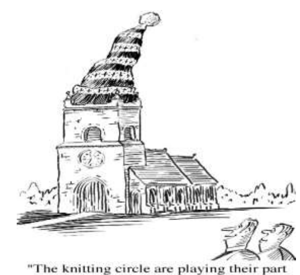
"The knitting circle are playing their par in our heating efficiency programme."

I was telling my three boys the story of the Nativity and how the Wise Men brought gifts of gold, frankincense, and myrrh for the infant Jesus. Clearly giving it a lot of thought, my six-yearold observed, "Mum, a Wise Woman would have brought nappies."